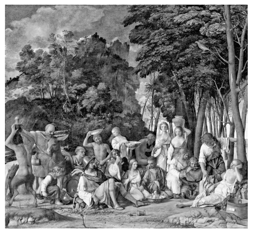
Figure 2. Giovanni Bellini , Feast of the Gods (1514). Oil on canvas.

nese porcelain that survives in Italy dates to the 1550s. By including an object that was so rare and inaccessible to most contemporary Italians, Mantegna's painting subtly perpetuates a fantasy of Italy's access to the farthest reaches of the East.